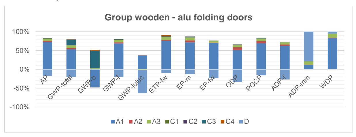
Figure 6: Influence of the modules A1 - A3, C1 - C4 and D on the analysed impact categories for wooden – alu folding door

Overall, the quality of the data can be considered as good overall. The primary data collection has been done thoroughly. Data quality was calculated using the Data Quality level and criteria according to the PEF approach (Annex E.2 of EN15804+A2). The DQRs range from 1,67 to 2,67 for the most abundant inputs in terms of mass.