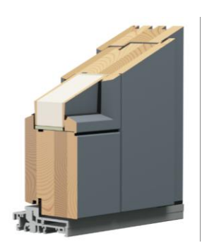
Figure 2: Folding wood doors