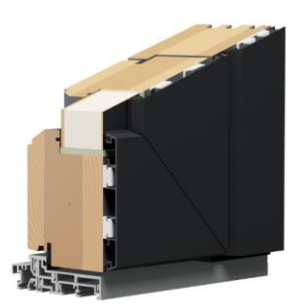
Figure 3: Folding wood-aluminium doors