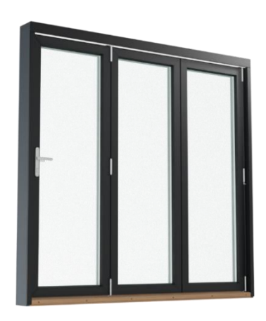
Figure 1: Door - Folding doors - wood with aluminium cladding